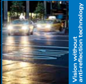
Vision without anti-reflection technology

Hoya offers a broad range of anti-reflective lenses to meet every performance need and budget.