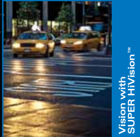
Vision with SUPER HiVision™